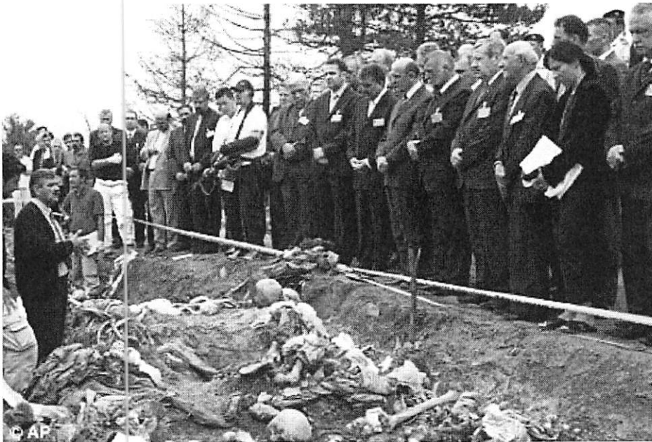
Foreign dignitaries visit recently discovered mass grave near Potocari, outside Srebrenica on the 10th anniversary of Srebrenica massacre in 2005. Nearly 8,000 Muslim men and boys were slaughtered in the killing